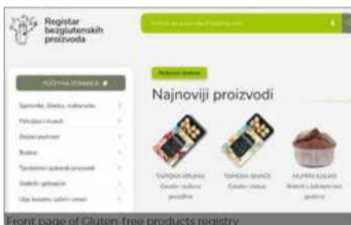
Front page of Gluten-free products registry

Apart from celiac patients, the Registry is a useful tool for all those involved in the procurement and preparation of gluten-free food, regardless of whether it is prepared in family homes, institutional kitchens (kindergarten, school, hospital...), hotels or restaurants caterers. Read more: