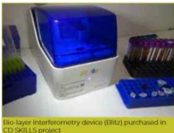
Bio-layer interferometry device (BLITZ) purchased in CD SKILLS project

Work package two aims to improve the diagnostics of celiac disease in the Danube region by harmonizing serum celiac antibody detection tools and optimize new technical approaches. During the project we purified IgA patient antibodies to get reference material for calibration antibodies and developed cloned antibody preparates to transglutaminase epitopes that can be applied in defined concentrations in the assay as calibrators. Further, medical partners collected patient serum samples which represent panels of study material for comparison in each antibody measurement assay utilized by the different centers. Approximately 320 serum samples have been collected so far by the project partners and one aliquot of each was sent in May to PPI0 for central testing. Celiac disease diagnostic tests usually measure IgA class antibodies, since they are of the relevant immunoglobulin type for the disease process. In order to do so, enzyme-labelled secondary antibodies against