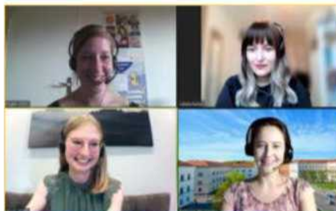
German celiac disease day was organized online to raise awareness about celiac disease