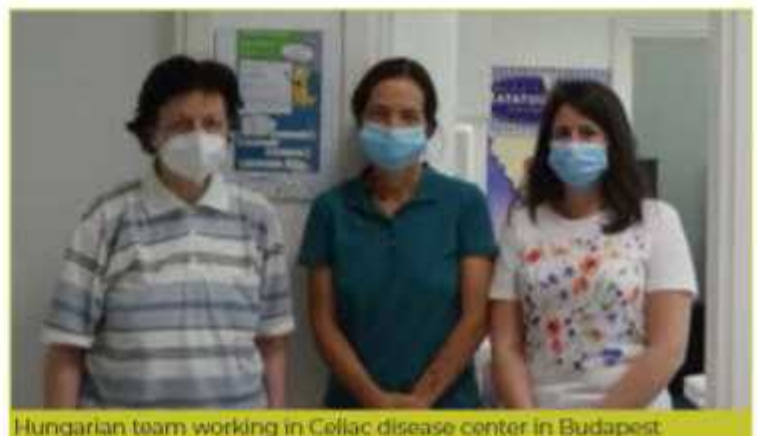
Hungarian team working in Celiac disease center in Budapest