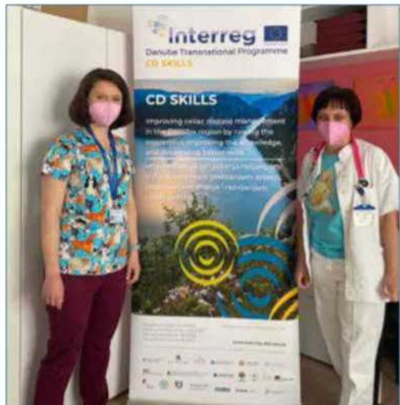
Cross-disciplinary Study visits have been postponed COVID-19 pandemics

In addition, project partners attended and actively participated at several international meetings (mostly held online) such as WCPGHAN (World Congress of Pediatric Gastroenterology, Hepatology and Nutrition), ESsCD (European Society for study of Coeliac Disease), Europediatrics, UEGW (United European Gastro week) and presented progress and results of the CD SKILLS project.