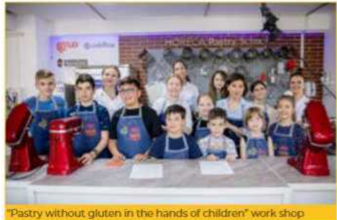
"Pastry without gluten in the hands of children" work shop

In the first half of the month, a gluten free baking workshop for children, "Pastry without gluten in the hands of children" , was organized with the support of Kids Chef Academy from Bucharest. During the session, the 11 participants had a hands-on experience and learned how to prepare gluten free pastry from a professional pastry chef. Read more: