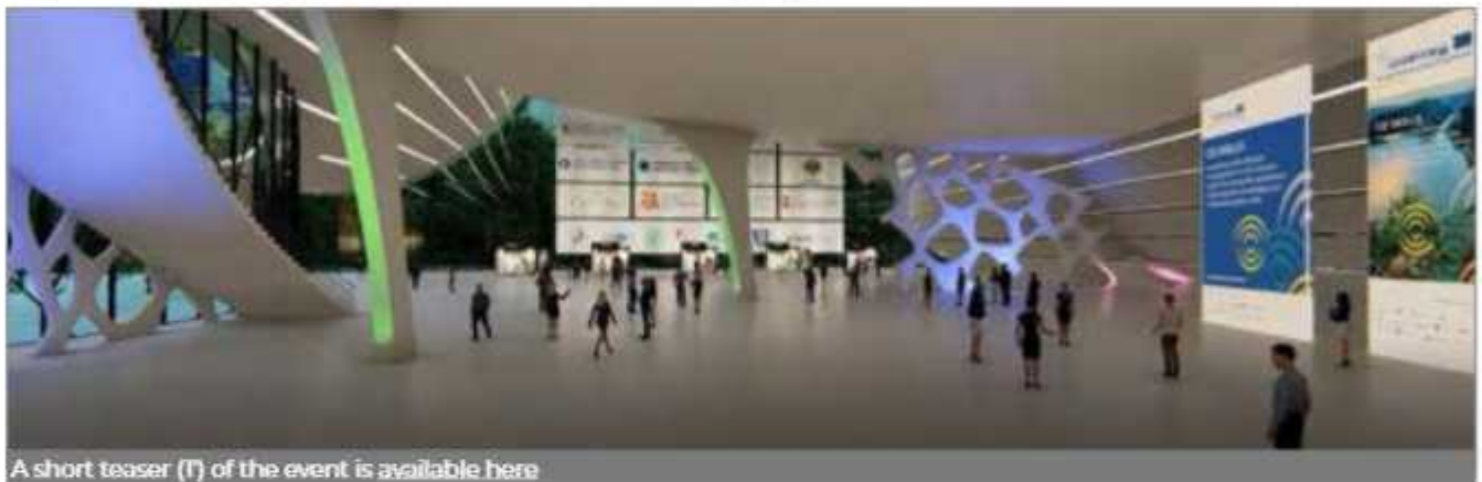
A short teaser (T) of the event is available here

https://www.interreg-danube.eu/news-and-events/programme-news-and-events/7329