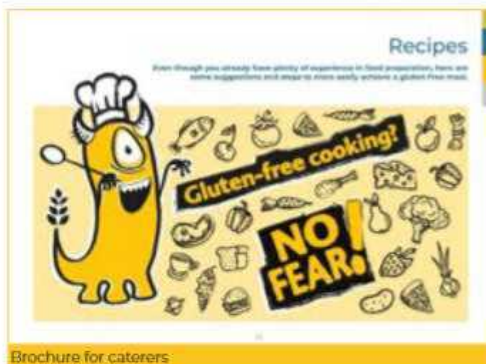
Brochure for caterers

This brochure will help catering professionals to increase their competences in preparing dietary meals for their guests who do not tolerate gluten. Read more: