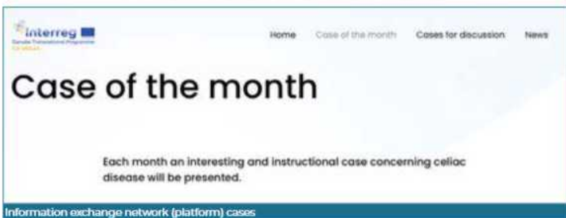
Information exchange network (platform) cases